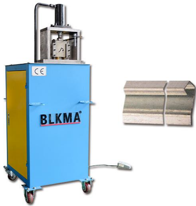
TDF Clip Cutting Machine