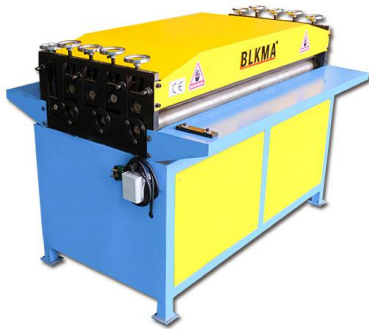
Leveling And Beading Machine